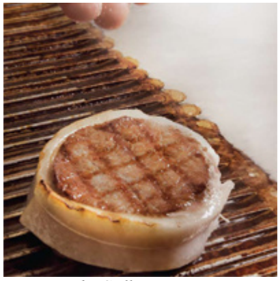
The Grilling Process